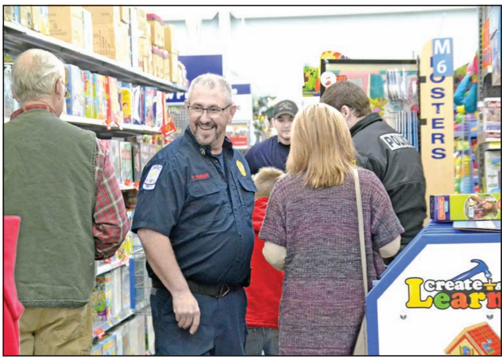
Towns County schoolchildren recently enjoyed shopping with local first responders, those who put the "hero" in Shop With A Hero.